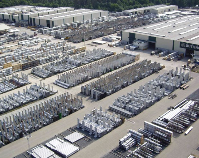
Dispatch by land, water or air - safely round the world in any case