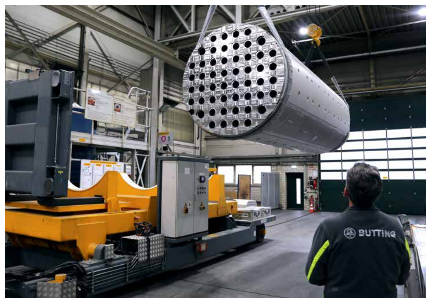
Series production CASTOR® V/52