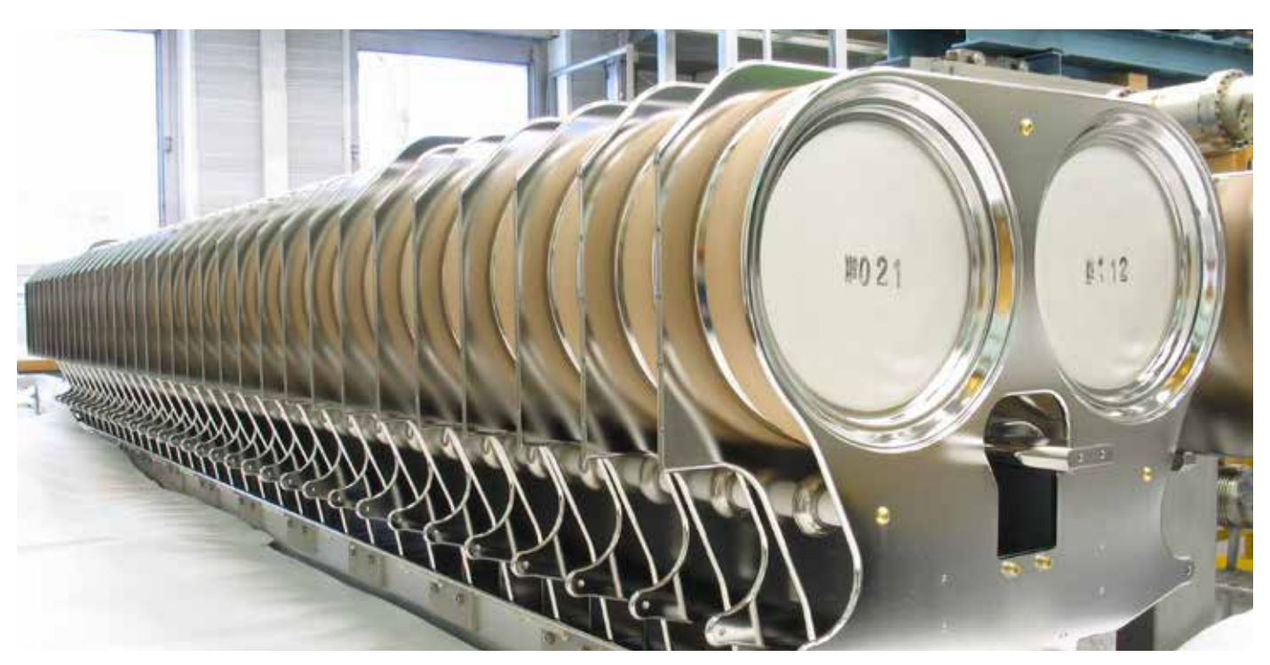
Assembly LHC Injection Kicker, CERN

Right from the start, we put our years of experience and extensive skills in special materials and processing to good use in this wide range of projects. With the knowledge gained from each project we have perfected and broadened our skills, leading to improvements both in the products and in lead times.