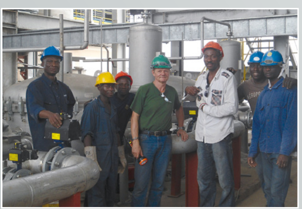
Project golden Sugar, Nigeria: prefabrication and supervising of the stainless steel pipeline for a sugar mill

Prefabrication of vessels in lean duplex for Australia. Installation was supported by us