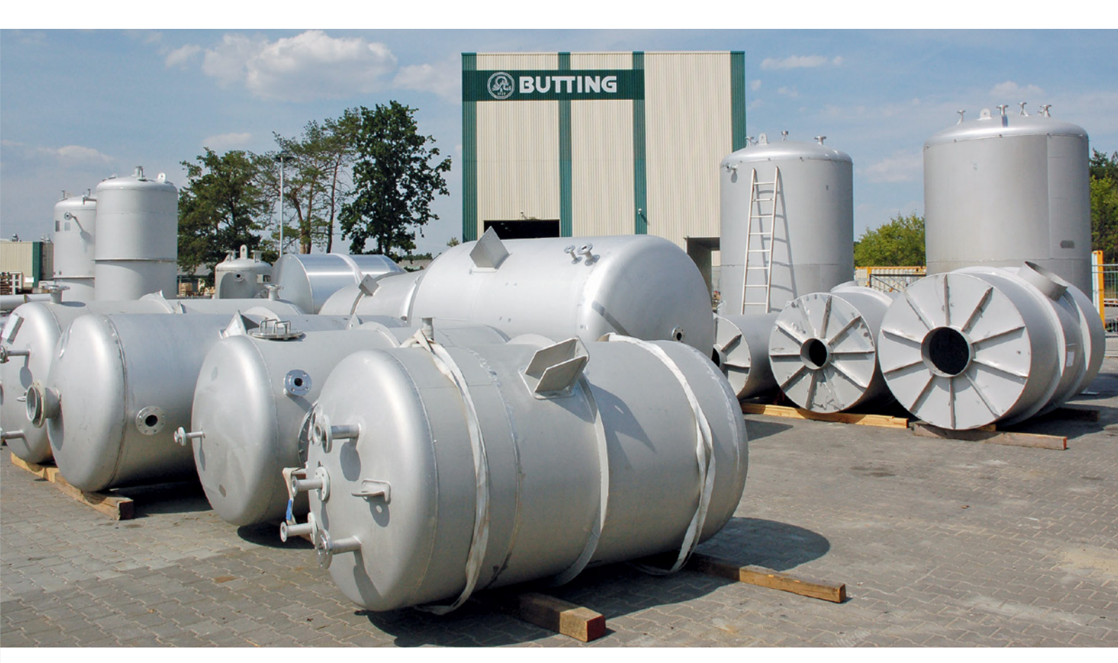
Inside and outside surface conditions according to the customer's special requirements can be offered