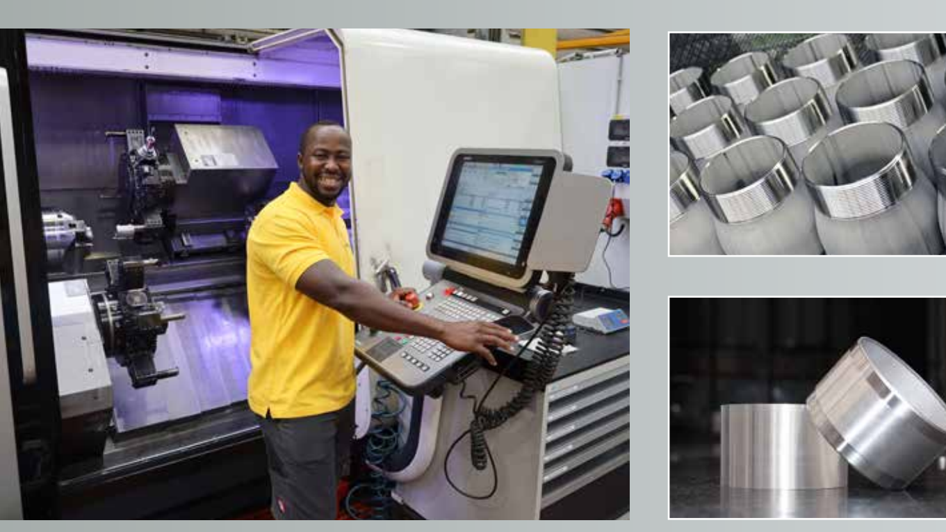
From prototype construction to series production; BUTTING is your partner