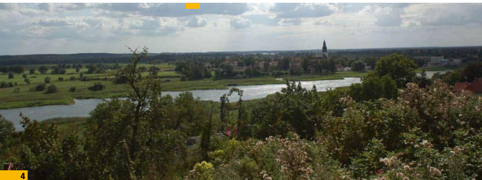
View of the Oder valley from the slopes of the former Butting family property