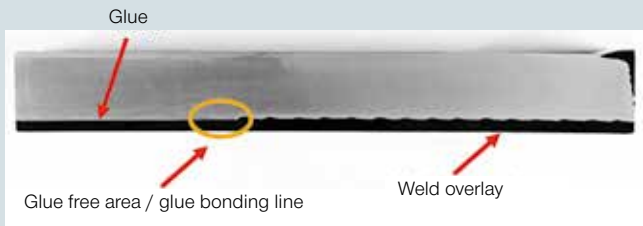
Fig. 2: Pipe end configuration incl. glue free area (metallographic cross section)